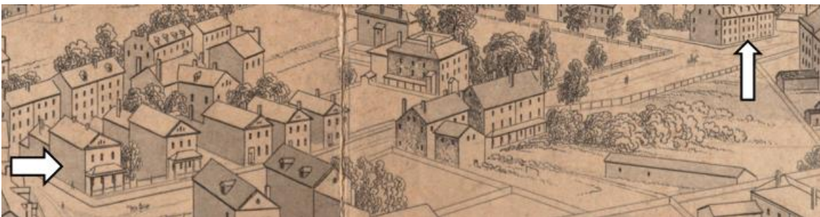
Chestnut Street, Mallory Panoramic View, 1848. Number 63, lt. arrow, numbers 17-21, rt. Arrow