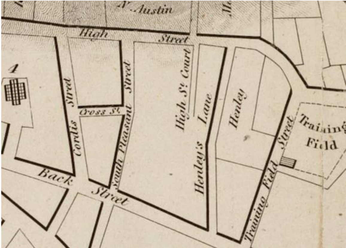
Peter Tufts 1818

Seven wood frame houses were included in the survey, built between 1789 and 1852. These included two late Georgian houses (1780, 1808), two Federal houses (1805, 1825?), and three Greek Revival houses (1851, 1852).