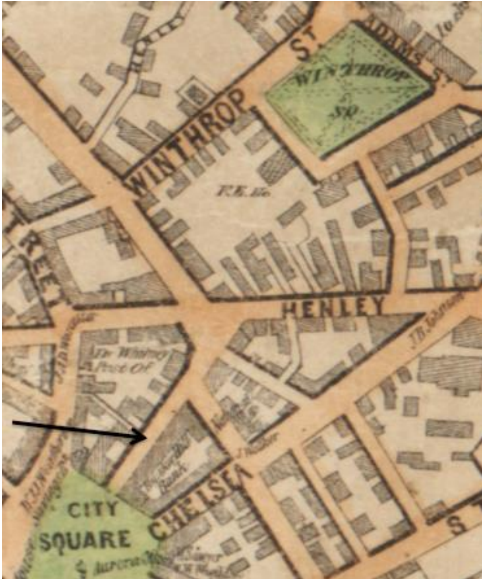
Future Park Street (arrow) area, showing the location of houses before extension to Common Street, McIntire, 1852

*Information drawn from Boston Landmark Commission's Charlestown Historic Resources Study 1981 (E. W. Gordon, Consultant), with the addition of photographs and images from early maps and/or the Mallory Panoramic View of Charlestown, when appropriate.