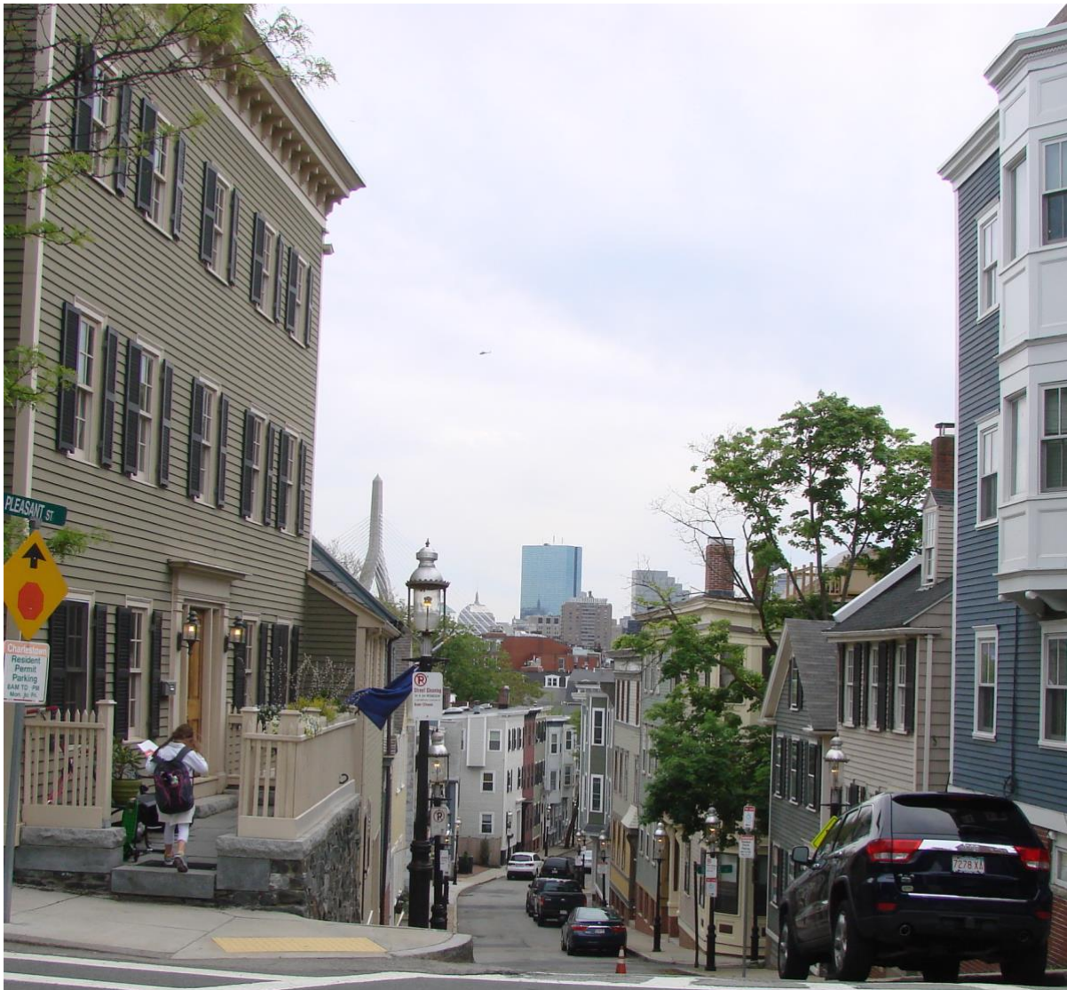
Pleasant Street, from High Street

Pleasant Street, one of the earliest streets laid out after the Revolutionary War, was set out circa the late 1790s. It appears on the 1818 Peter Tufts map of Charlestown labeled South Pleasant Street.