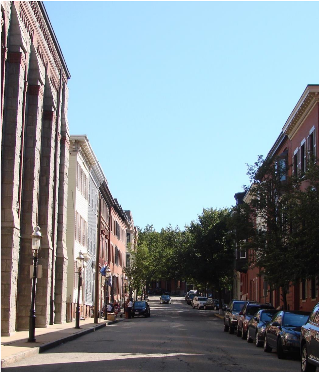
Winthrop Street, view from Warren Street