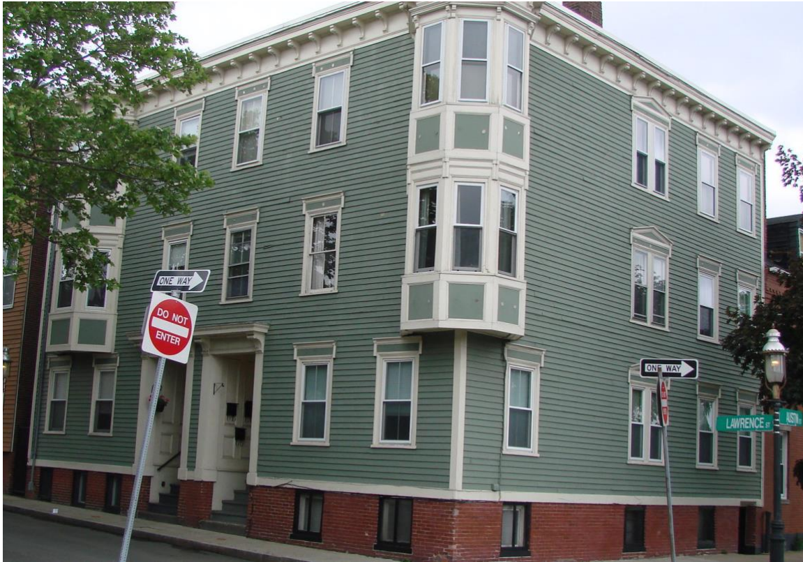
18, 20 Lawrence Street