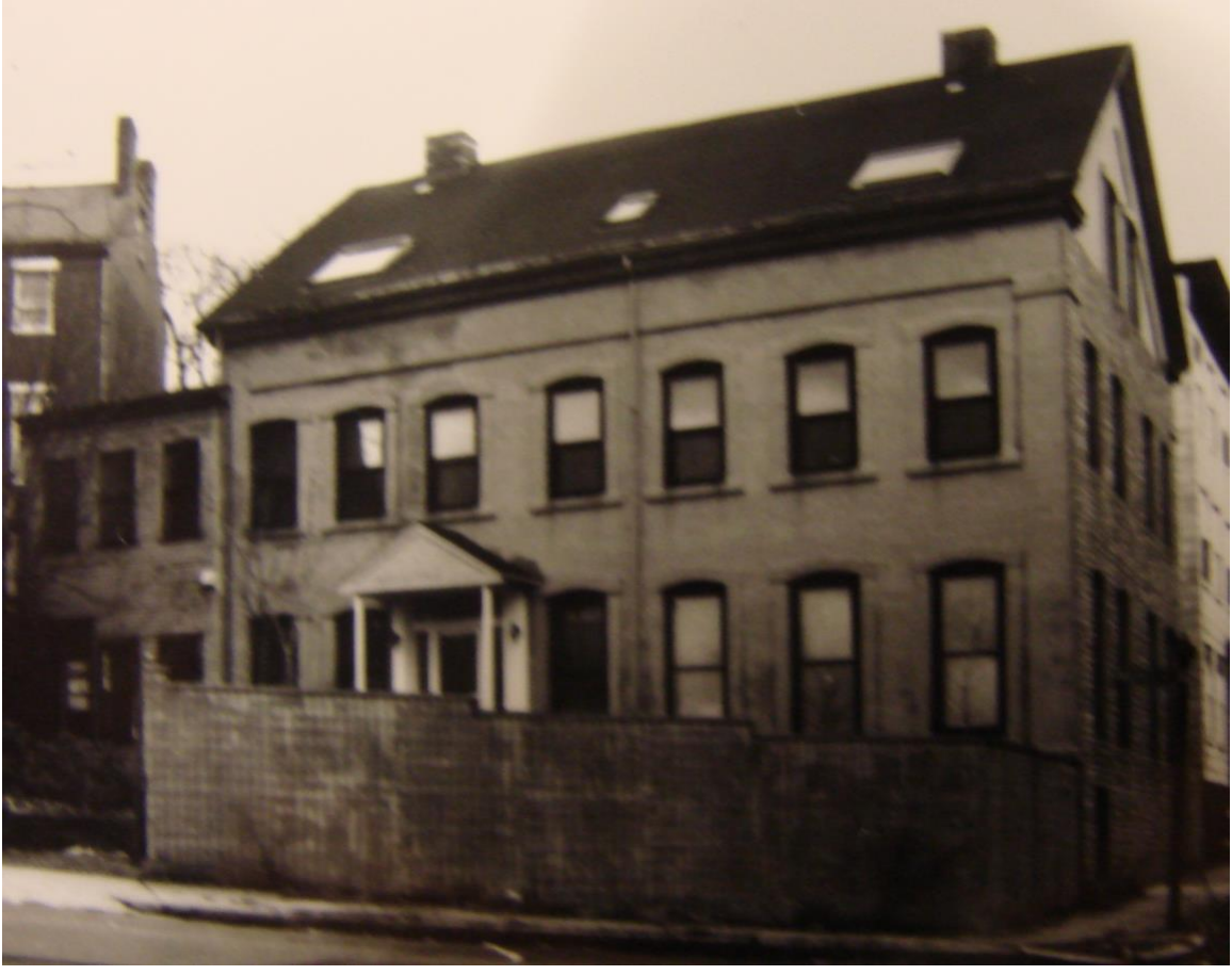
Prospect Street entrance (21 Tremont Street) 1980s

enframed with raised surrounds that are slightly segmentalheaded. Off-center main entrances are on the sidewalls, with a later porch addition projecting from the Prospect Street entrance.