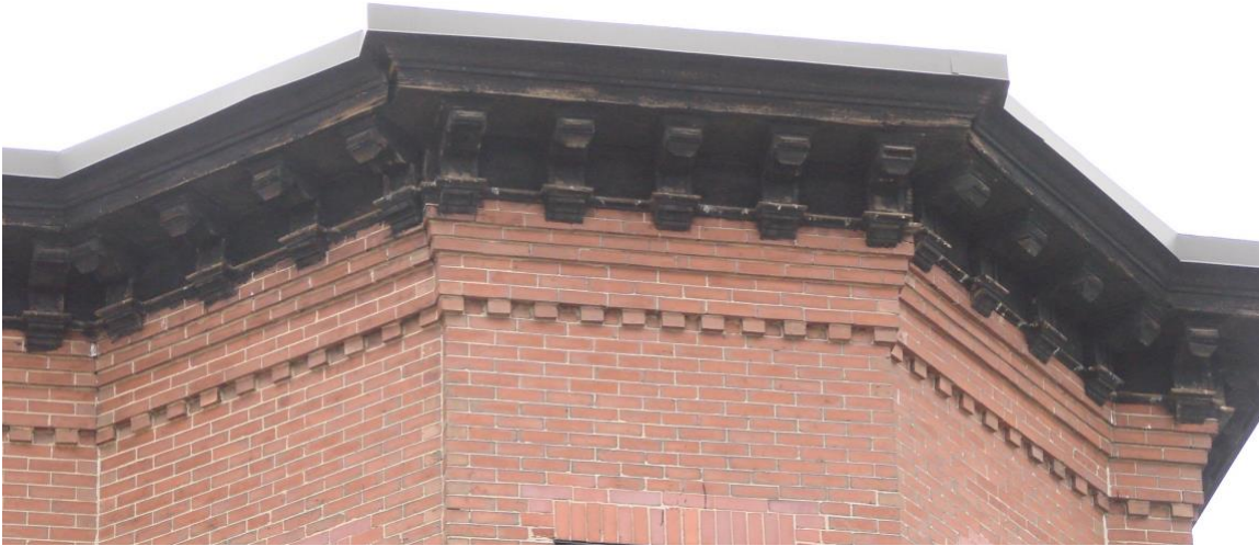
217 Main cornice detail