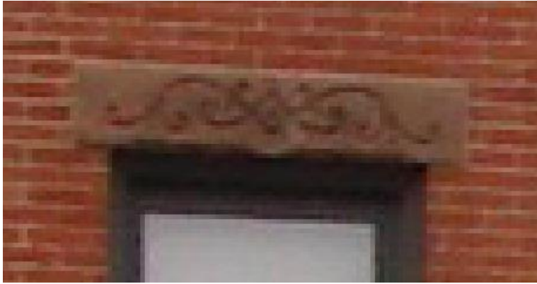
421 Main lintel detail