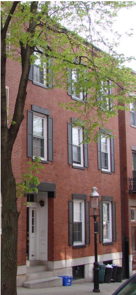
47 Monument Avenue 2015

Numbers 47 and 49 Monument Avenue are flat front masonry row houses with three bay main façades and granite basements. Both were originally Italianate and similar to numbers 15-45 Monument Avenue. Number 49 is now Italianate/Mansard by virtue of a post-1865 Mansard roof addition.