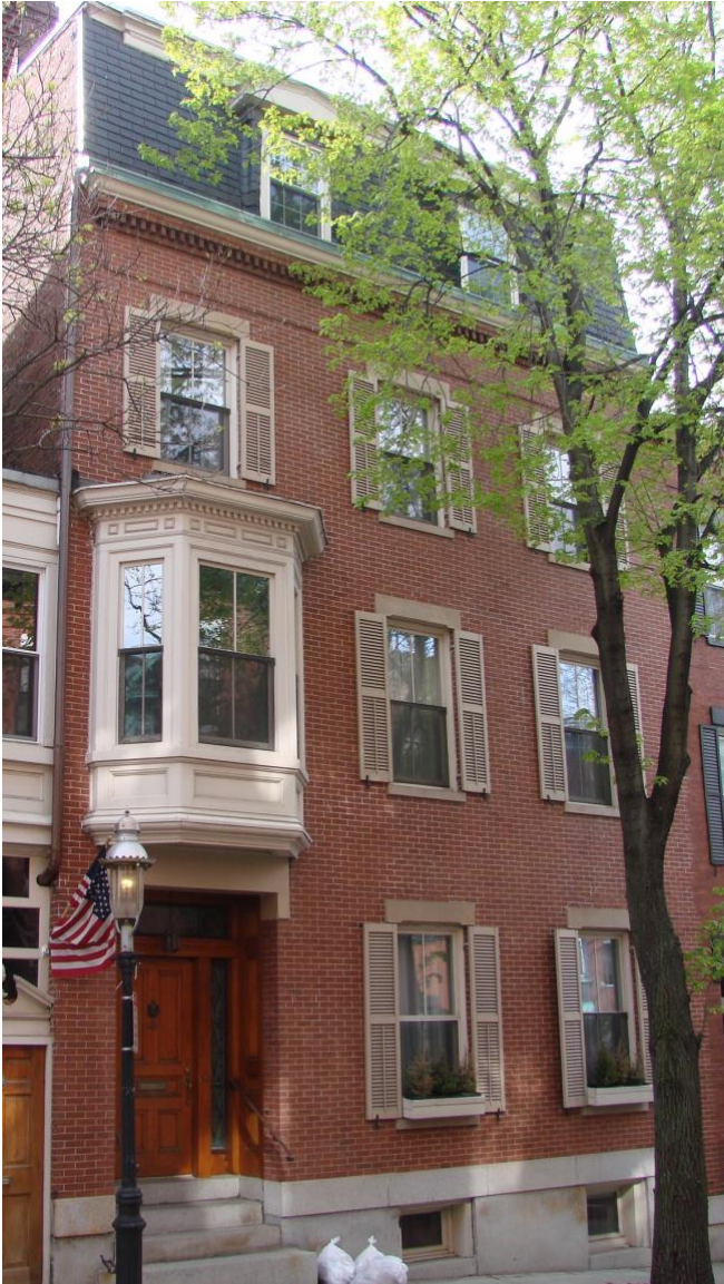
49 Monument Avenue 2015

Number 47 has a shallow brickwork corbel table with dentils. Number 49 has an identical cornice table but with a steep sided mansard roof, with mostly intact slate shingles. A pair of dormers on 49 is capped by segmental hoods. Both houses have side hall plans.