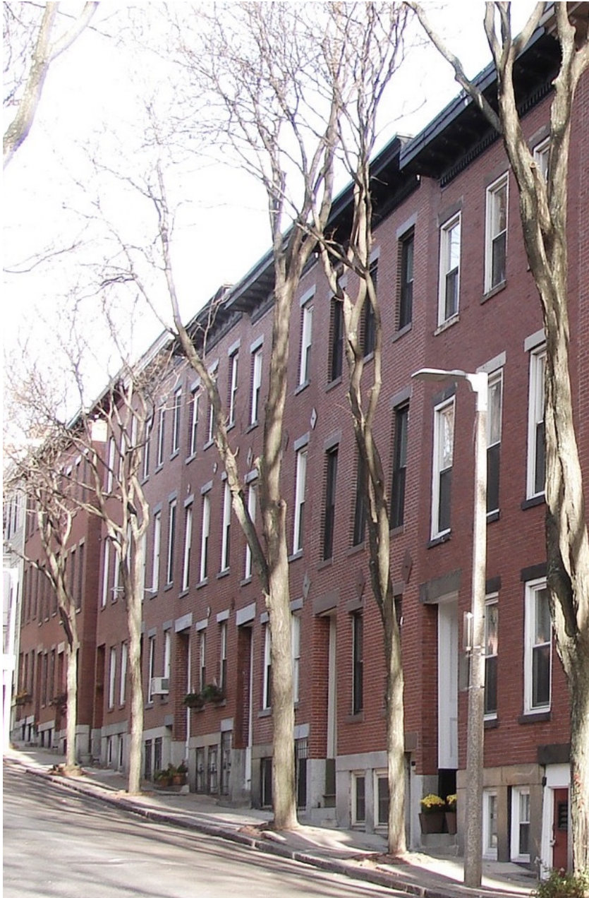
5- 15 Auburn Street

From Boston Landmark Commission's Charlestown Historic Resources Study 1981*: