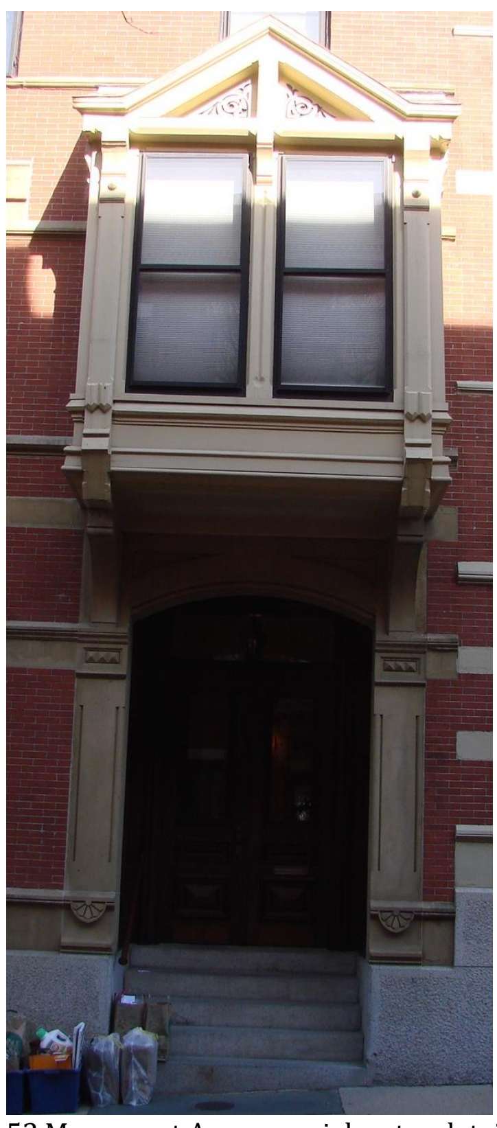
52 Monument Avenue, oriel, entry detail