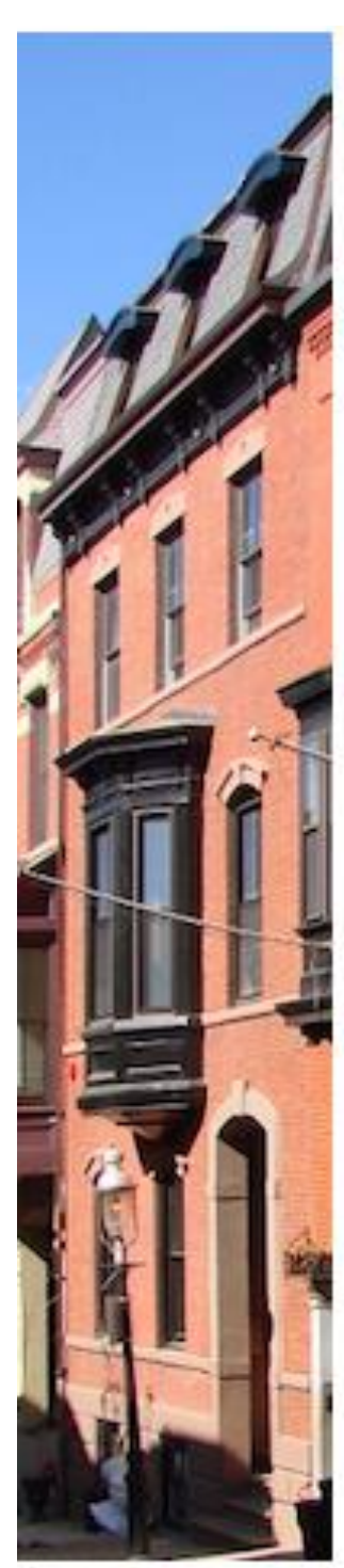
56 Monument Avenue