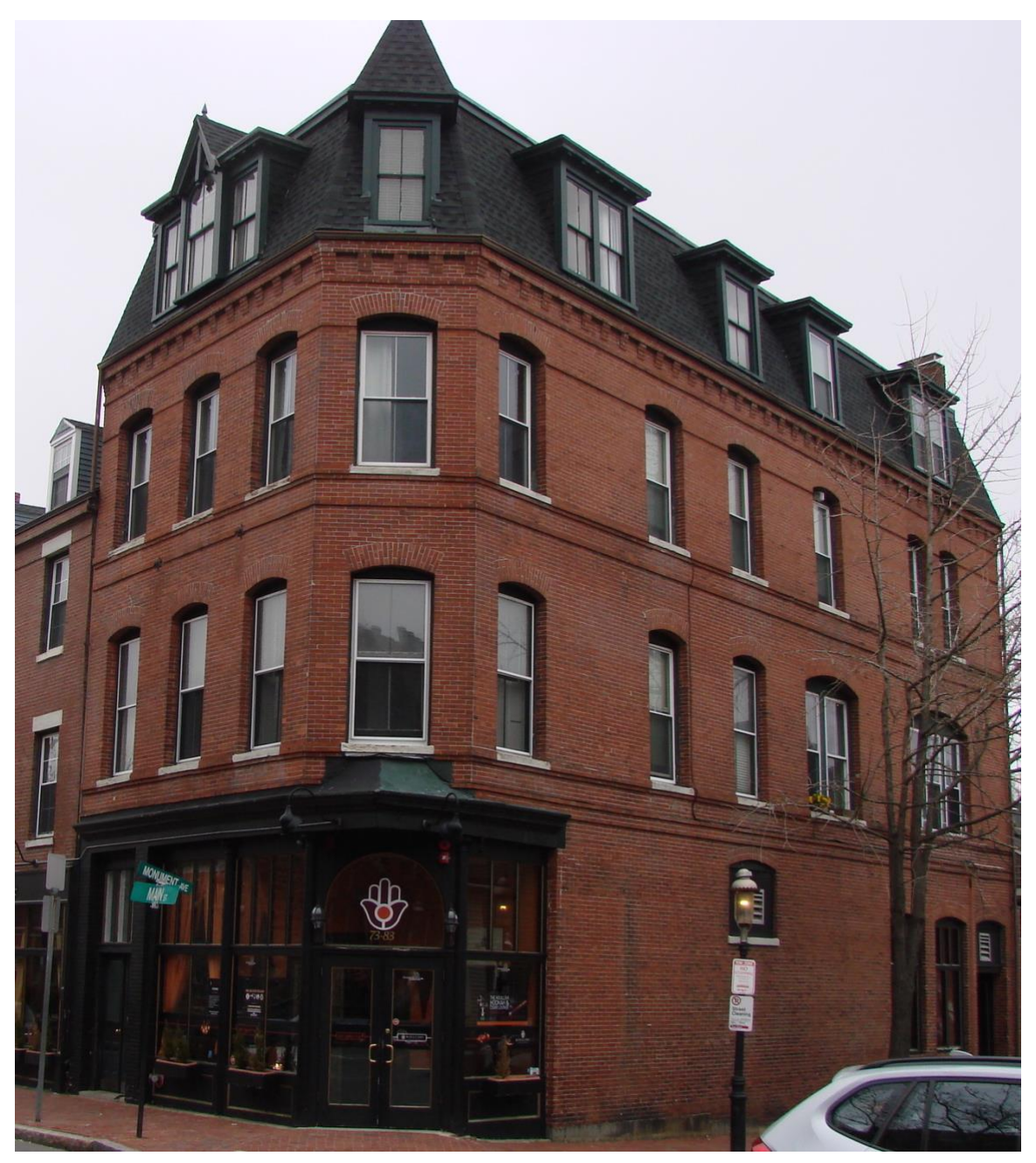
73 Main Street 2016

The corner building, 73 Main, is constructed of brick with a 19th century storefront treatment at the Main Street/Monument Avenue corner. The upper floor is characterized by flat surfaces with a narrow brickwork course above and below the windows providing horizontal accents. There are small corbels at regular intervals at the cornice. The