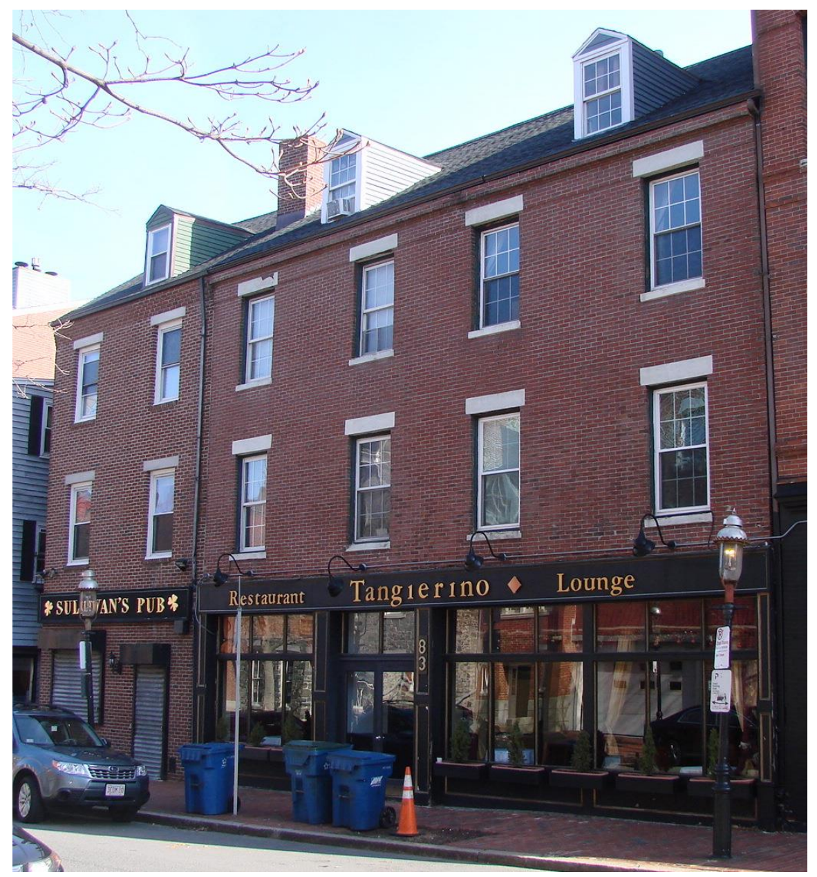
85, 83 Main Street