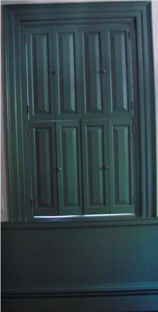
81 Warren interior shutter and wainscot