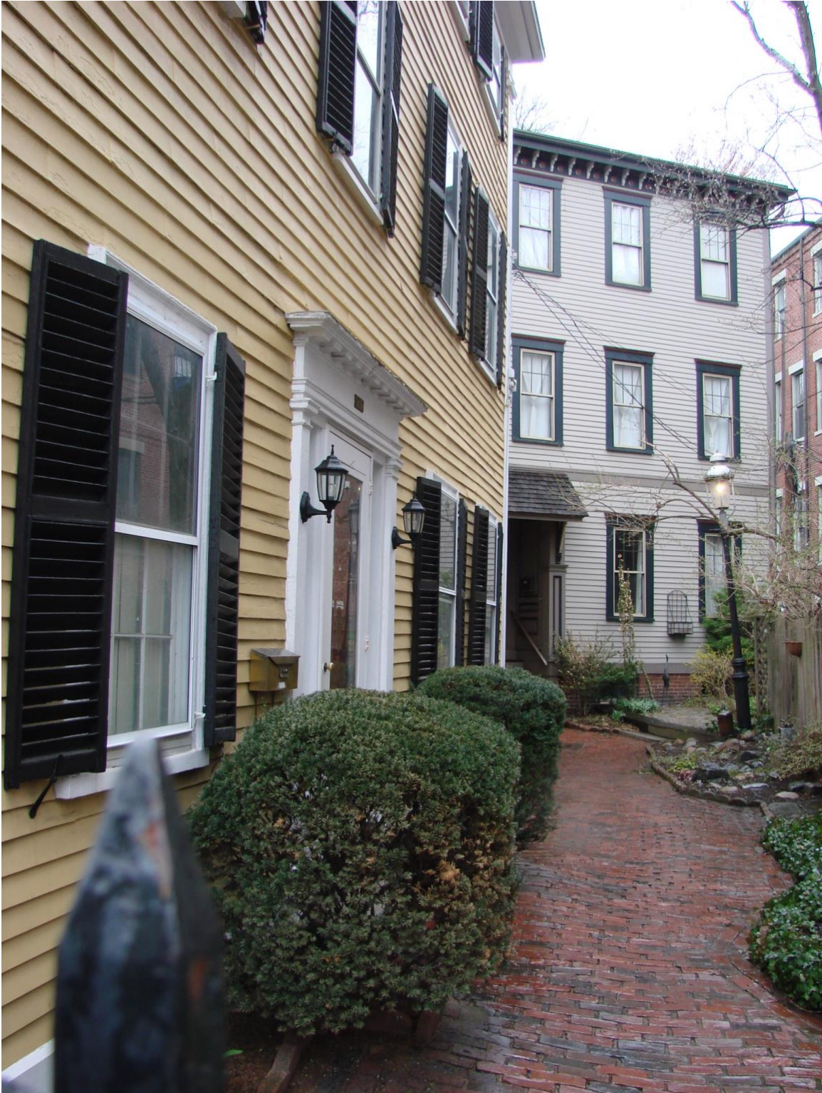
Donnell Court, 81 and 81 1/2 Warren