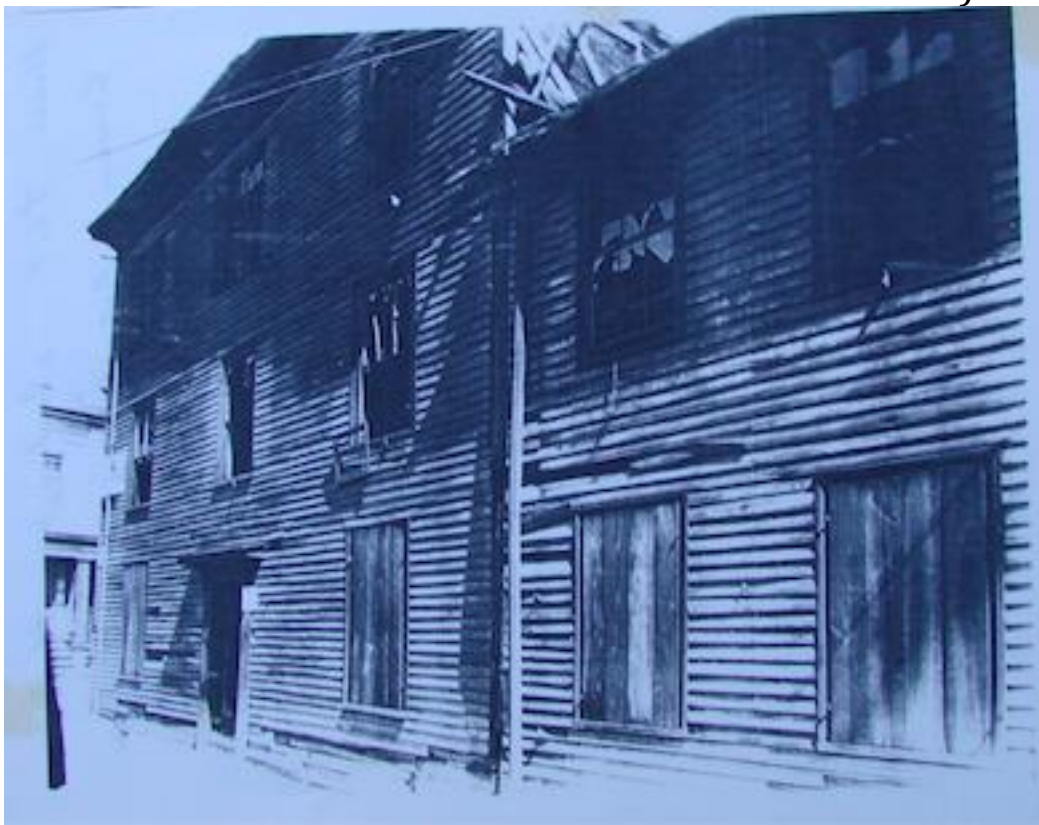
21 Pleasant Street

Number 81 ½ was either moved to the rear portion of 81's lot circa 1885-82 or built here, although its Italianate massing and elements suggest a much earlier (circa 1850s or 60s) construction date. The 1880s and 90s was a time of considerable construction activity in Charlestown. Number 81 ½ could have been moved from any one of half a dozen sites around Charlestown. (A photograph provided by current 81 resident Ken Stone, of 21 Pleasant Street, since demolished, which occupied the present garden space between 81 ½ and Pleasant Street suggests that 81½ was probably built on site since this house would have blocked access to its lot.)