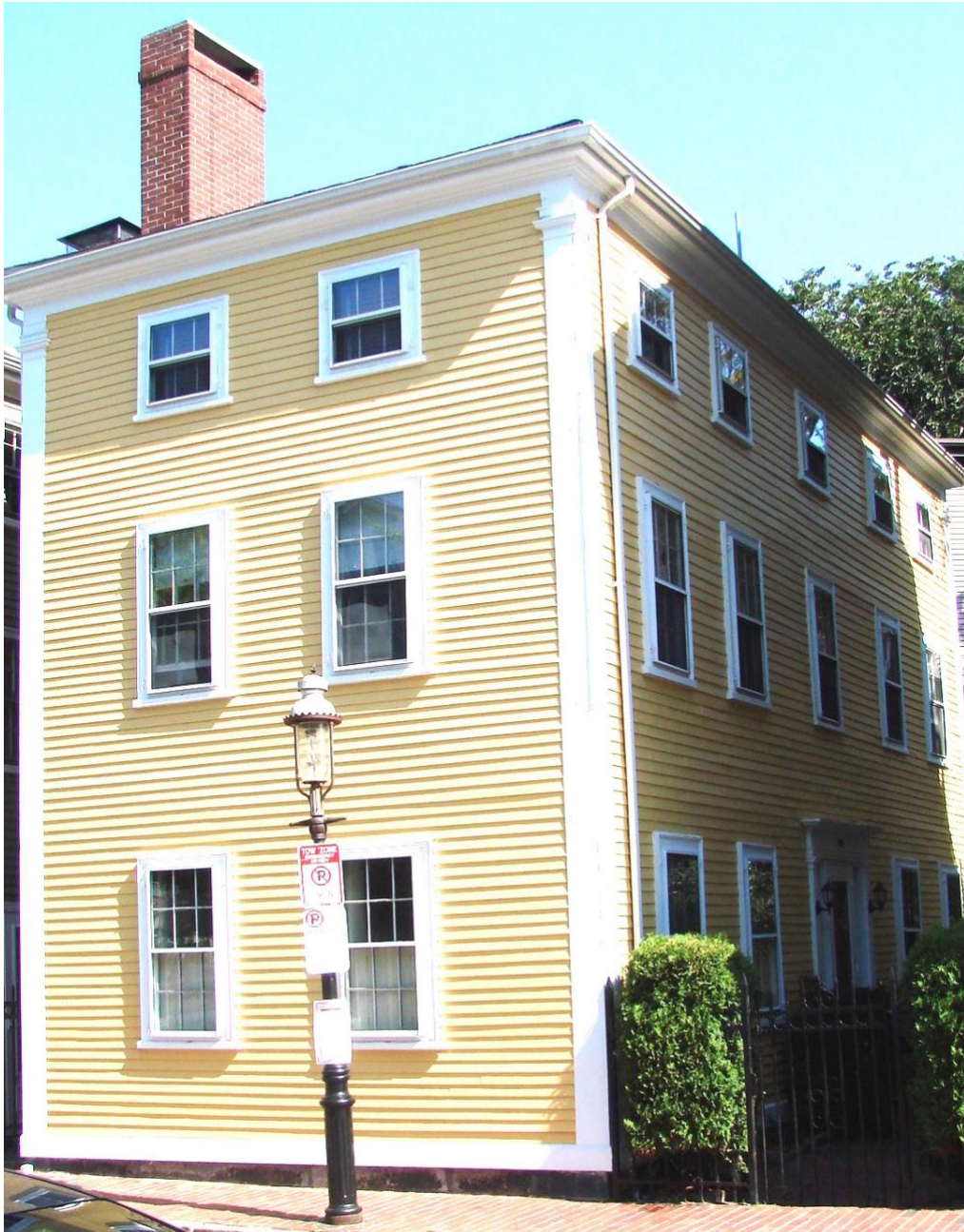
81 Warren Street

From Boston Landmark Commission's Charlestown Historic Resources Study 1981*: