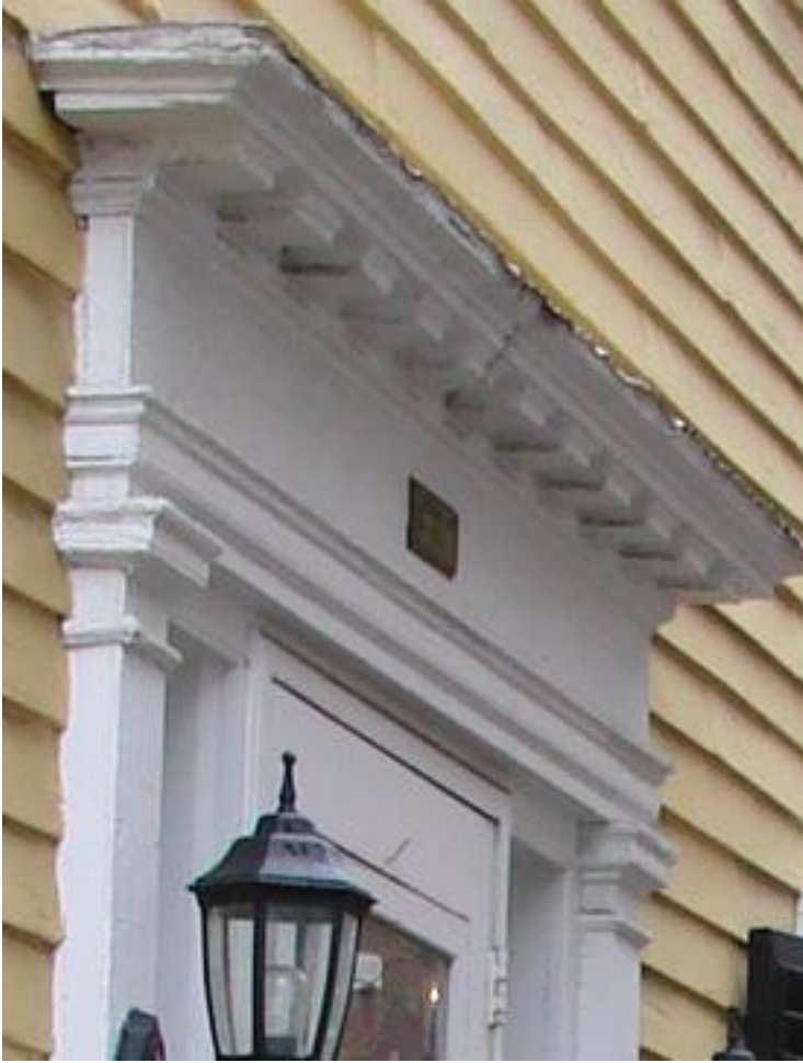
81 Warren entry detail