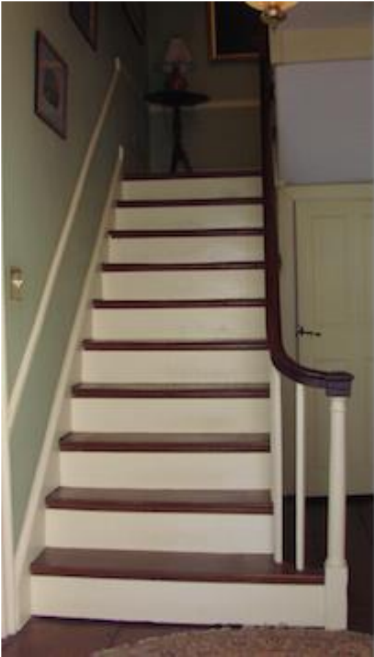
81 Warren Staircase